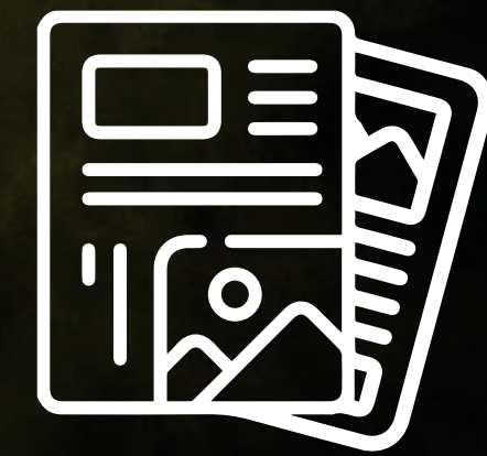
Menu & Brochure Design