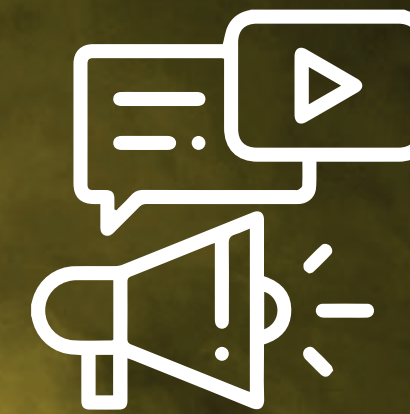
Social Media Marketing