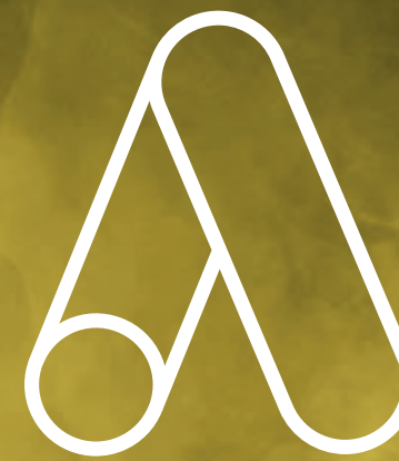
PPC Marketing Google Business & Ads