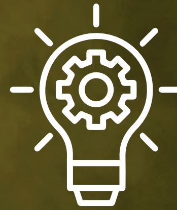
Brand Strategy & Identity Design